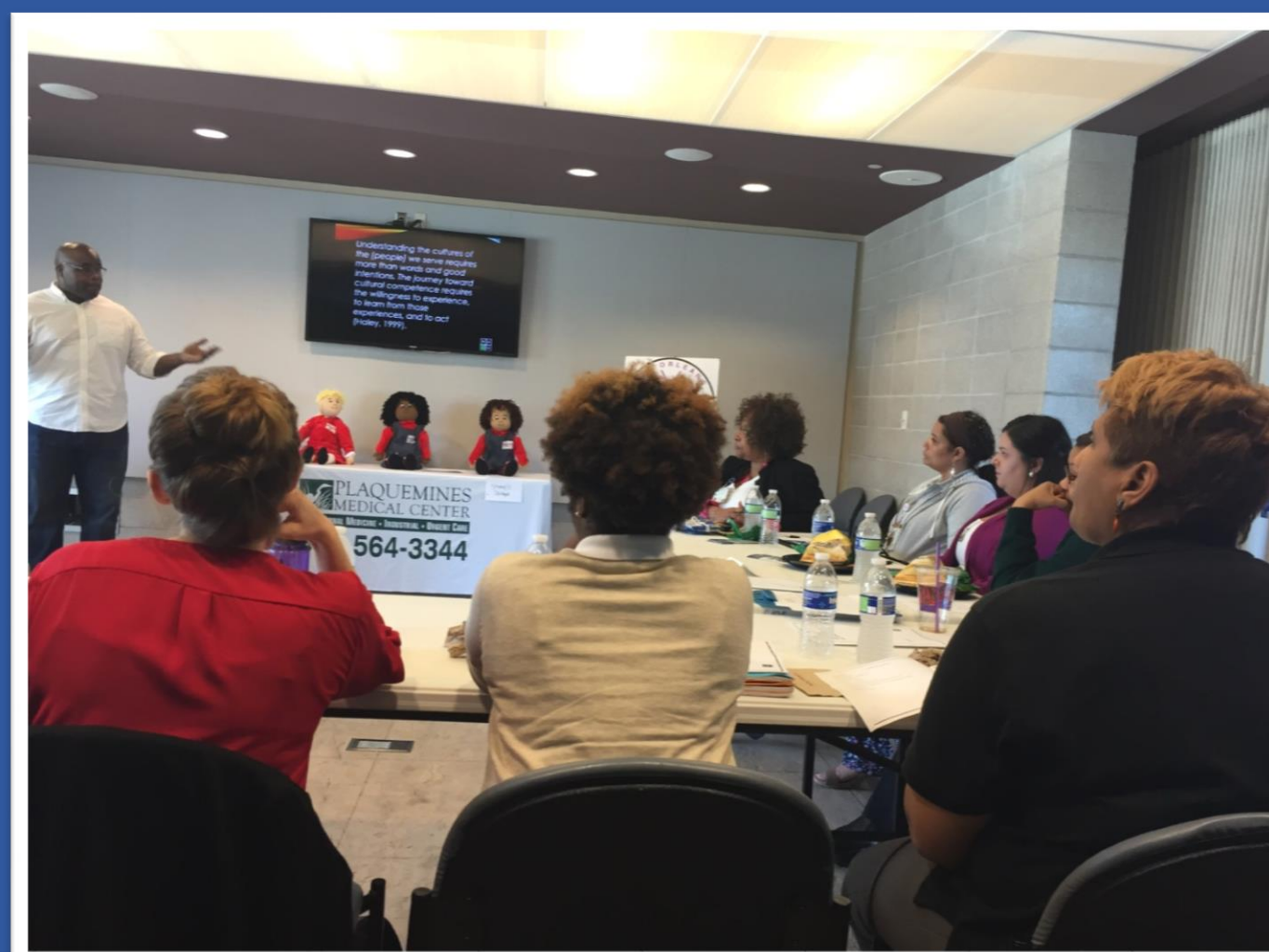
Cultural competency training for staff and the coalition