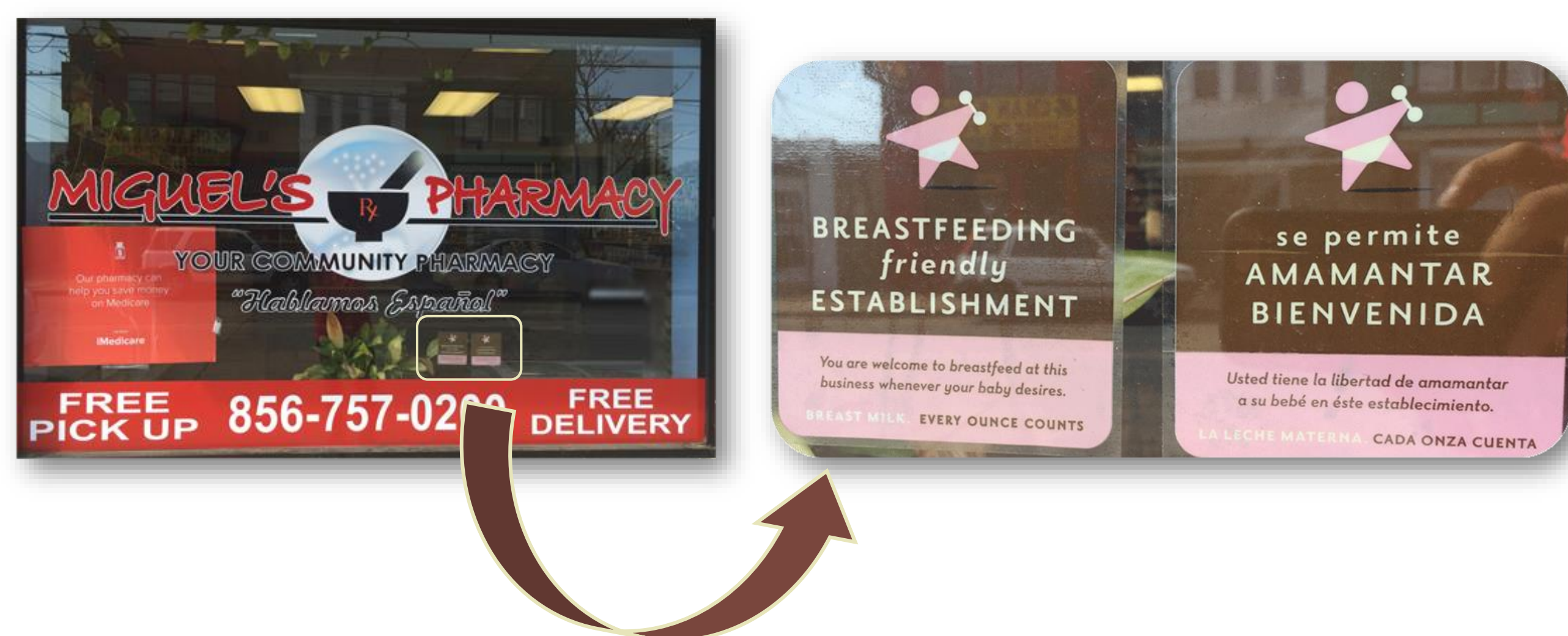
Miguel's Pharmacy, a Breastfeeding Friendly Establishment. Supporting a healthy community and the BFE initiative by displaying the window clings.

This poster focuses on two initiatives: Breastfeeding Friendly Establishment (BFE) and WIC Rx Nutrition pads. The BFE initiative was a way for businesses to support breastfeeding moms and a healthy community. Businesses can show their support by displaying the BFE window cling on their front door. The WIC Rx Nutrition pads were developed as a referral tool for healthcare providers, head start programs and others.