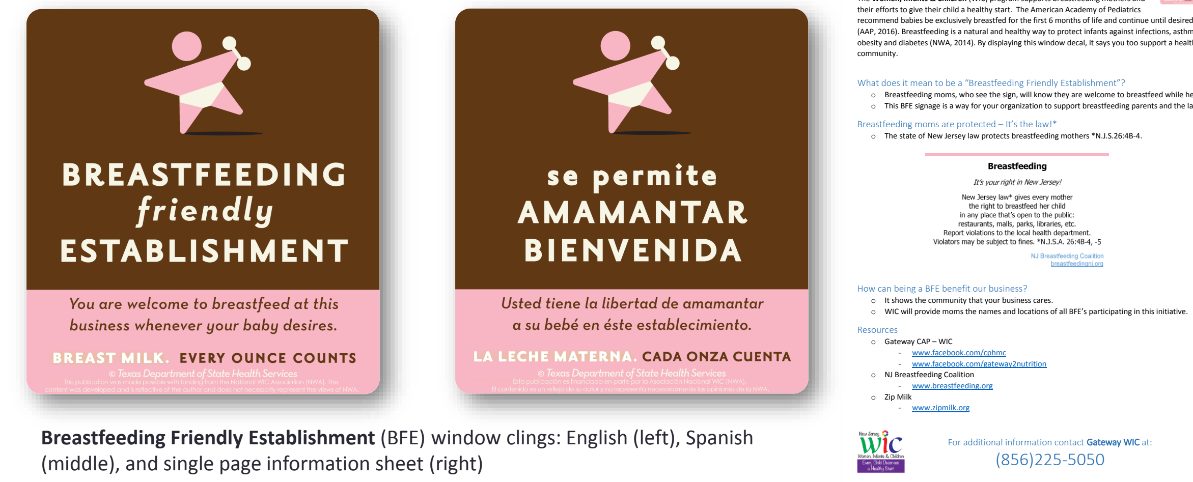
Breastfeeding Friendly Establishment (BFE) window clings: English (left), Spanish (middle), and single page information sheet (right)